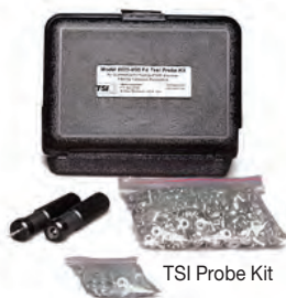
TSI Probe Kit