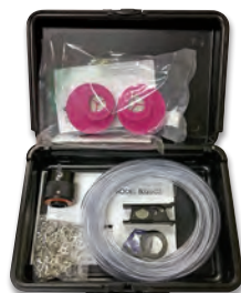
TSI Fit Test Adapter Kit